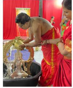
Deity Installation procedures - Jaladhivasam, Ksheeradhivasam, Dhanyadhivasam, Pushpadhivasam, Annadhivasam, Phaladhivasam, Seyyadhivasam