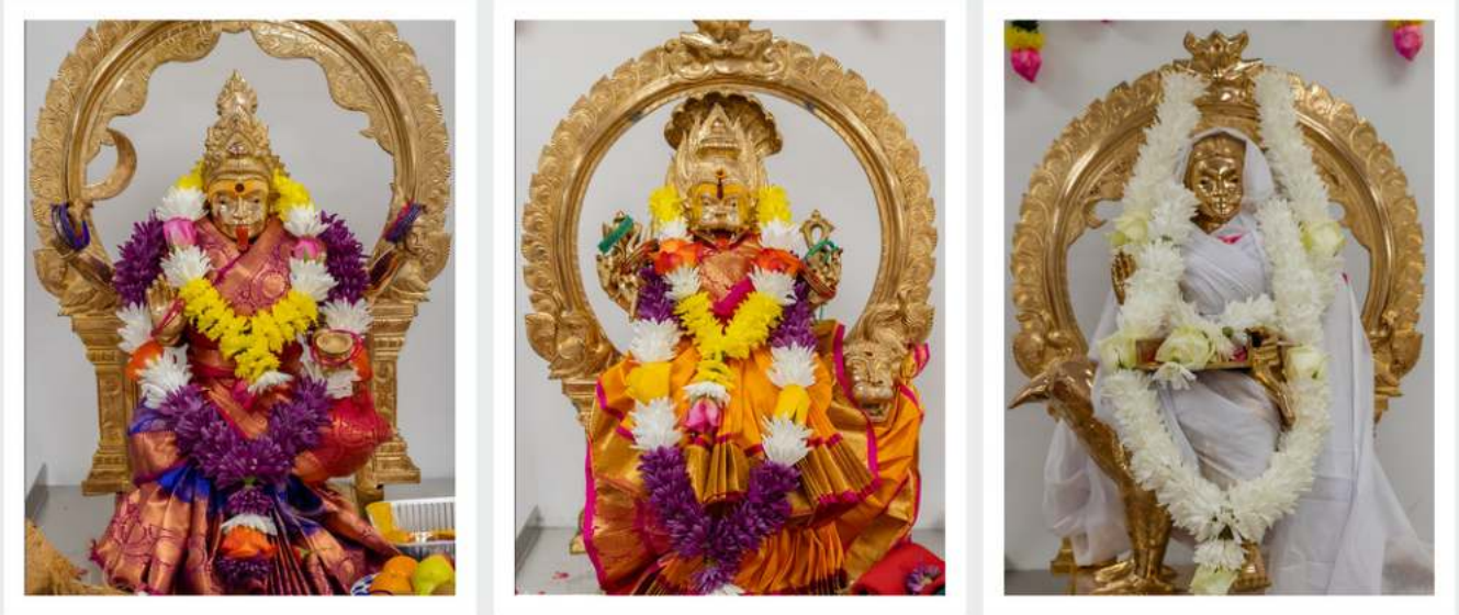
Sri Kaali Devi, Sri Pratyangira Devi, Sri Dhoomavati Devi