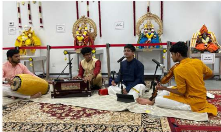
Everyday Musical Offering during Vaaraahi Navratri