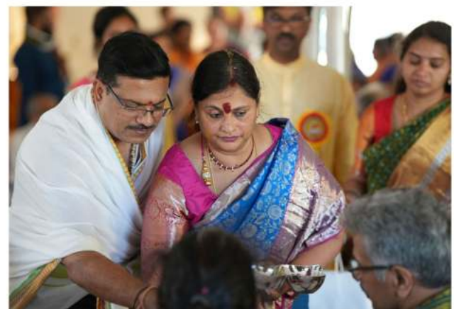
Suvasini Puja & Dampati Puja