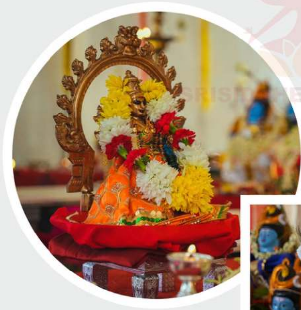
Shiva Shakti Kalashas & Sri Chakra Navavarana Puja