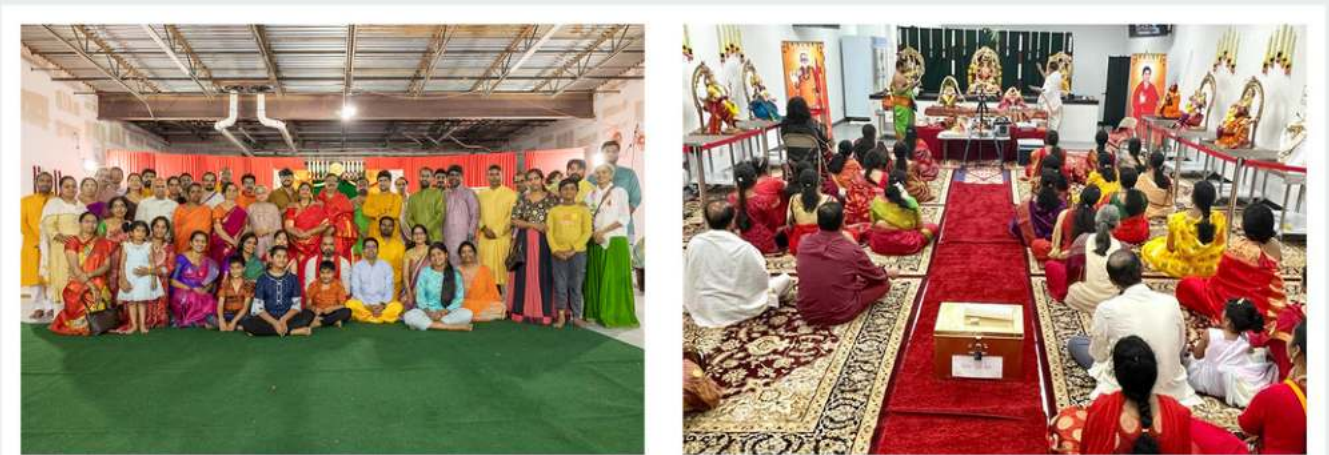
Devotees during Vigraha Pratistha & Lalitha Sahasranama after Deity Installation