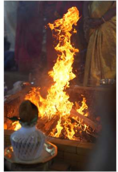
Purnahuti of AtiRudra Maha Yagam