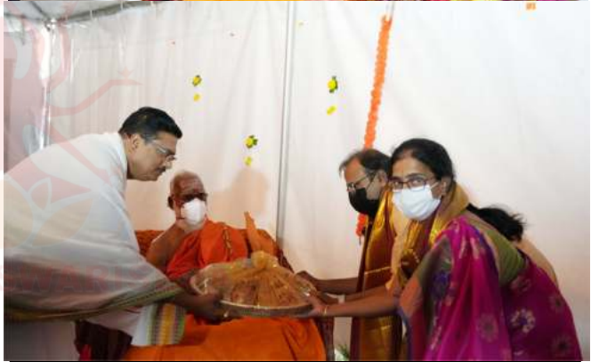
Swamiji's Blessings to the AtiRudram Sponsors