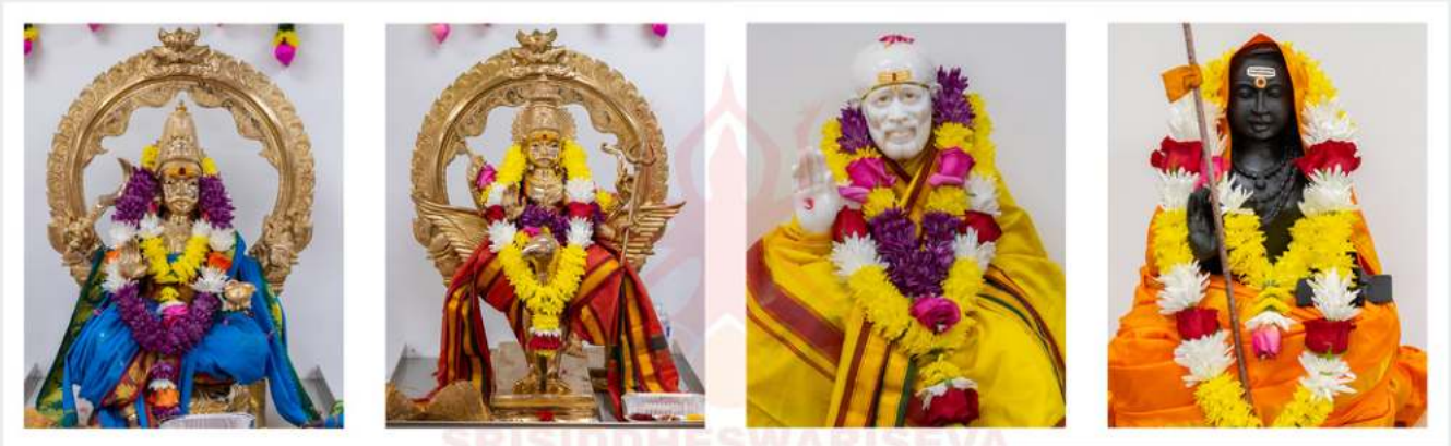
Sri Kaala Bhairava Swamy, Sri Shaneeswara Swamy, Sri Sai Baba, Sri Adi Shankaraacharya