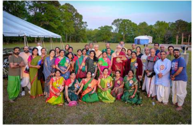
GRD Iyers GuruCool Ritwiks