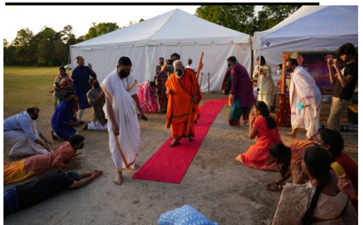
Devotees seeking Swamiji's blessings