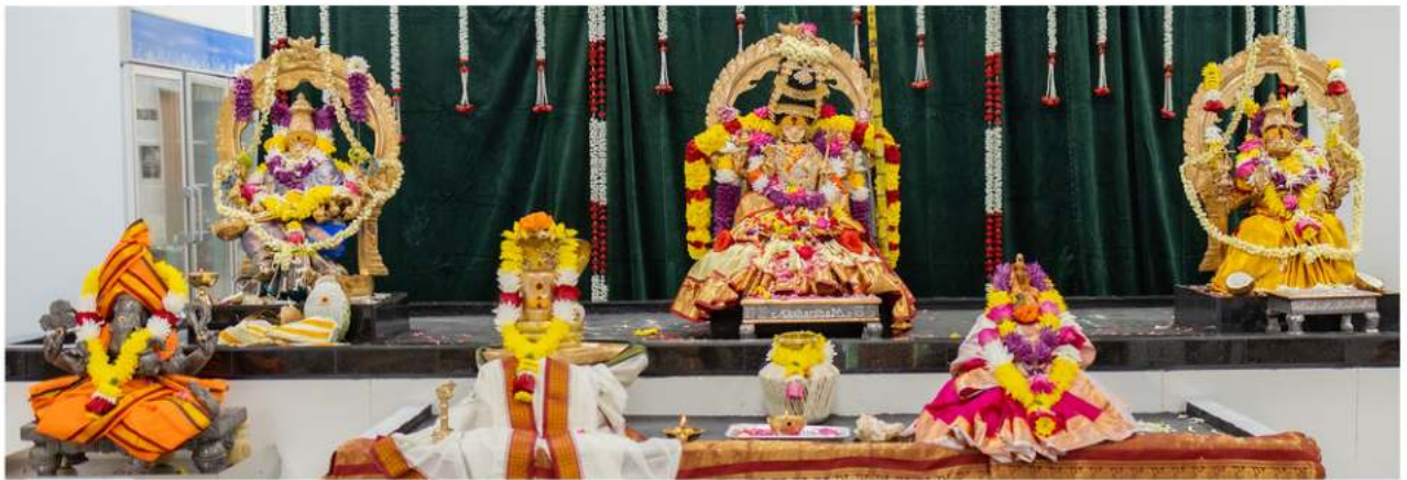
Sri Lalitha Parameswari Devi along with Maatangi, Vaarahi Devi, Kshipra Ganapathi, Siddheswara, Siddheswari Devi (Sri Chakra Meru)