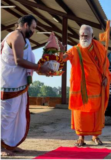
Purna kumbha swagatham to Pujya Swamiji in Shangri-La & Yathi Vandanam by 108+ Ritwiks