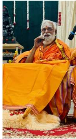
Aksharabhyasam to Devotees by Pujya Swamiji in Sree Devi Peetham